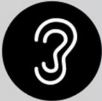
Ergonomics Ear Pads