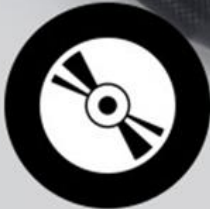
HiFi Sound Quality